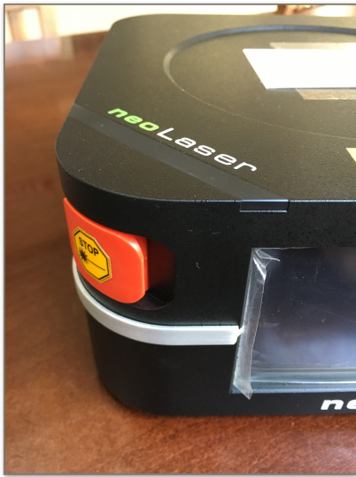
Emergency Stop Engaged Position