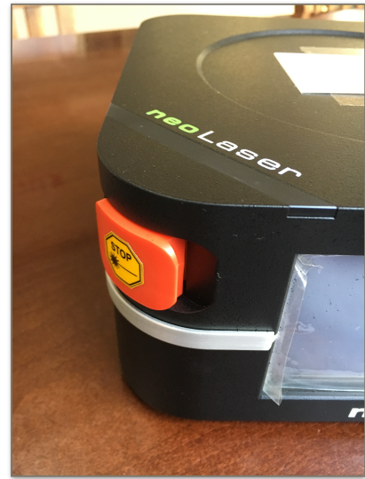
Emergency Stop Open Position (required to operate the laser)